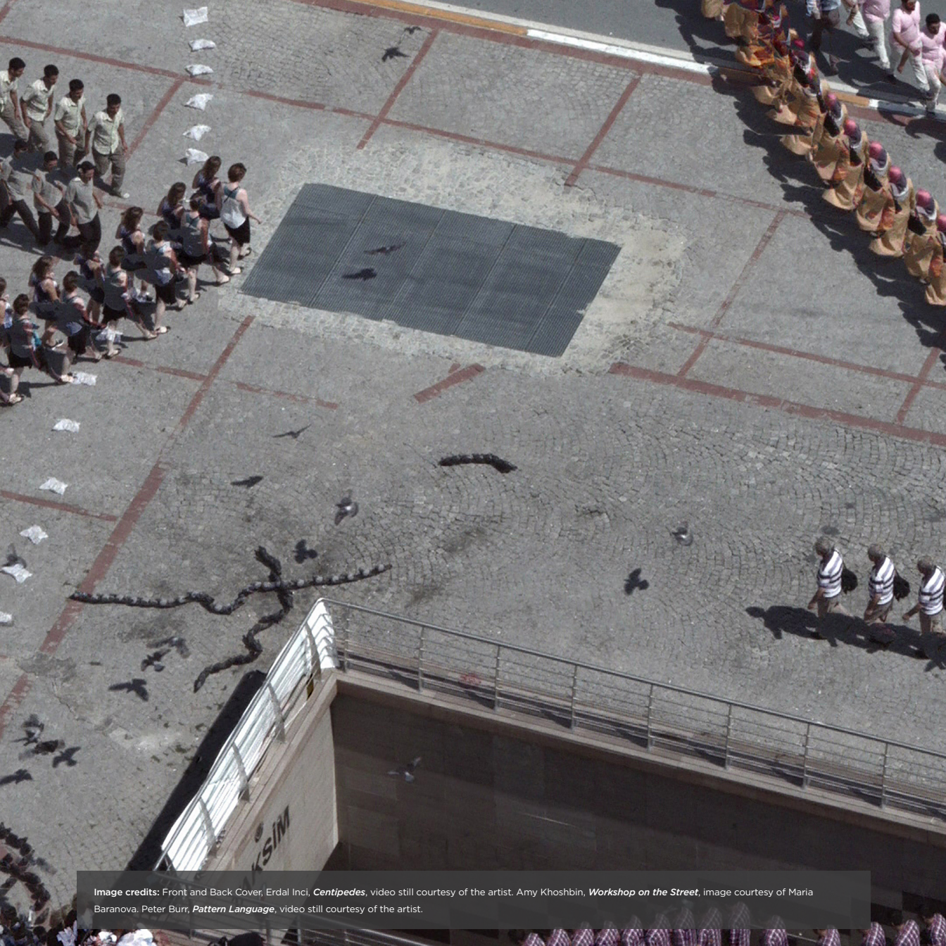
Image credits: Front and Back Cover, Erdal Inci, Centipedes , video still courtesy of the artist. Amy Khoshbin, Workshop on the Street , image courtesy of Maria Baranova. Peter Burr, Pattern Language , video still courtesy of the artist.